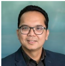
Romulae R Gadaoni

In November 2024, the Australian and the US share market demonstrated a strong upward trend, largely influenced by positive economic indicators and a rally in US markets following Donald Trump's election victory, which boosted investor confidence in anticipated pro-business policies. Conversely, the Australian residential property market showed signs of cooling, with a modest increase in home values and declining sales activity attributed to rising borrowing costs and affordability challenges. The Reserve Bank of Australia maintained its cash rate amid ongoing inflation concerns, while mixed forecasts regarding future interest rate movements highlight uncertainty about economic growth and the potential impact of US policies on Australia's economy.